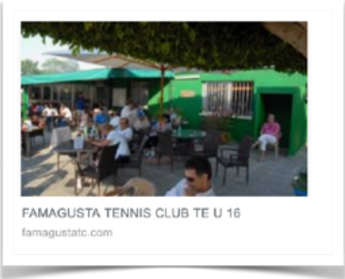
Famagusta Tennis Club