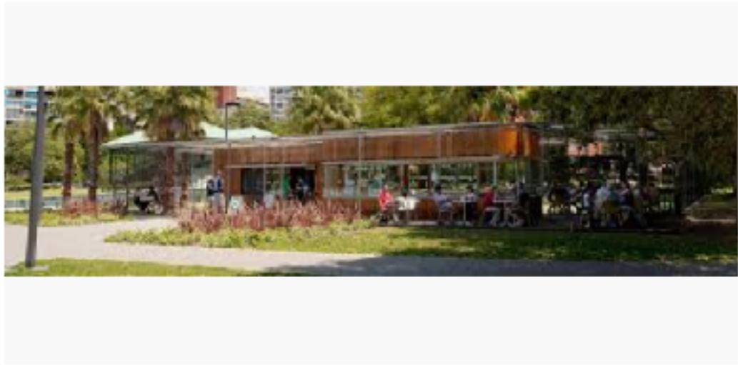
Kiosk at Rushcutters Bay Tennis in Sydney rushcuttersbaytennis.com.au

The under cover area that is currently used a few times per year can be far more functional and promote a more open and friendly environment. These renovations can be done on a budget and may even engage some skills from the Cessnock Men's Shed. These are the spaces that attract new patrons to the venue.