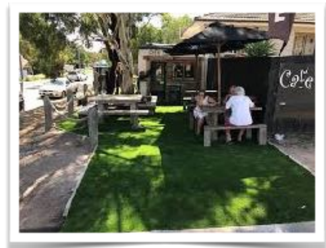
Synthetic grass in area