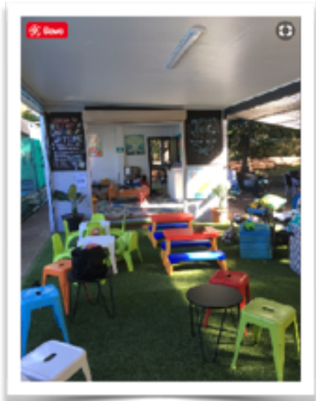
Ferny Grove Brisbane Kids area